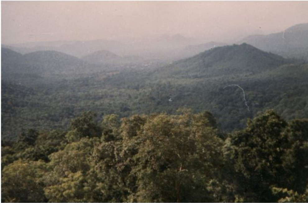
Gadiya Mountain, Kanker